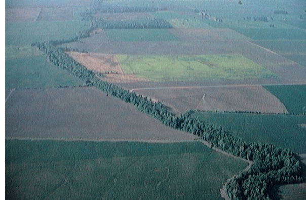
Figure 1. Riparian buffer strips protect water quality and provide habitat for plants and animals, and movement corridors for a variety of wildlife species

BACKGROUND: Over the past several decades, more than 450 Corps of Engineers Civil Works reservoir projects have been constructed in 43 states encompassing nearly 12 million acres (at normal pool elevations, about one half is water and the remaining half is associated land). The majority of inland Civil Works projects are constructed along streams and rivers. There is increasing interest in managing the riparian buffer strips (i.e., vegetation adjacent to streams, rivers, and lakes) along these watercourses. Retaining riparian vegetation of proper width not only minimizes the impacts of erosion and nonpoint-source pollution; these areas also provide habitat and movement corridors for wildlife as well as benefits to fish populations (Fischer et al. 1999) (Figure 1). Unfortunately, when decisions are made to restore or manage buffer strips adjacent to streams and rivers, the basis for determining strip width has been almost completely dominated by water quality considerations. Few studies have addressed the compatibility of recommended buffer strip widths with other important ecological functions, especially their ability to sustain native faunal and floral species.