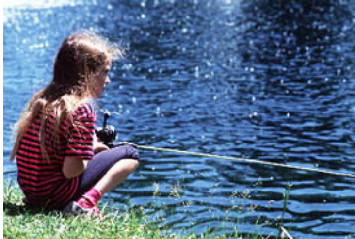
DNR loans fishing equipment for free at 30 offices, state parks and other facilities.

To reach young people in a variety of ways, we turn to teachers interested in ways to bring the environment into the classroom. Youth leaders such as boys and girls clubs, summer camp staff, fishing club members, and alcohol and drug abuse counselors also teach fishing skills to help build youth self-esteem.