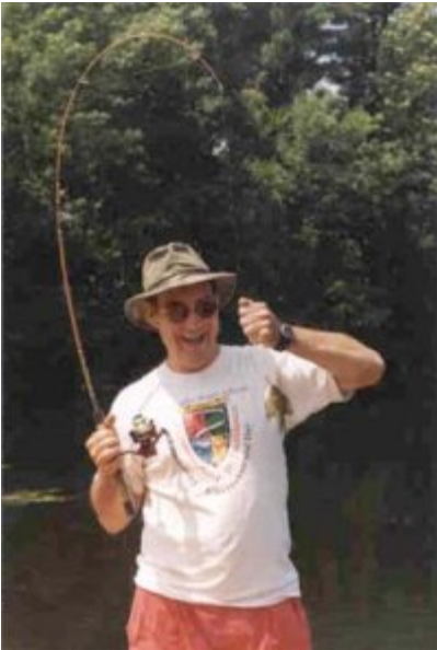
Angling education programs help kids and adults experience the joy of fishing.