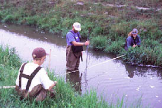
Measuring a stream's width, depth, flow rate, temperature, pH, dissolved oxygen and nutrient levels.