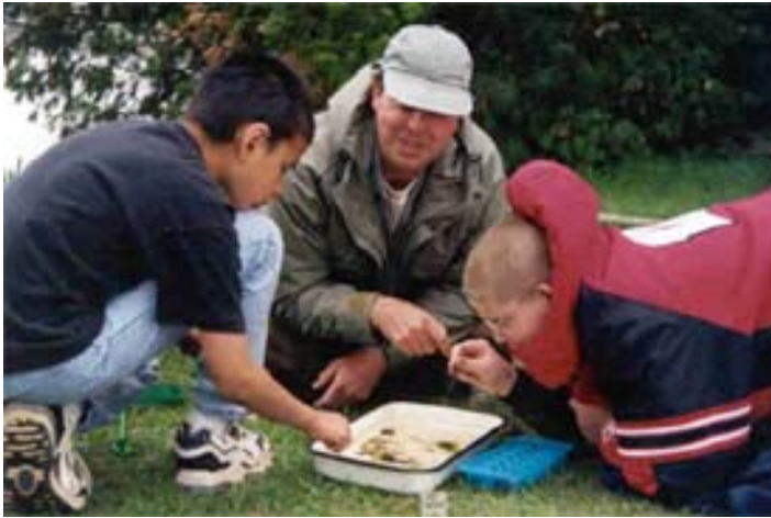
Exploring aquatic insects on a visit to a school stream.