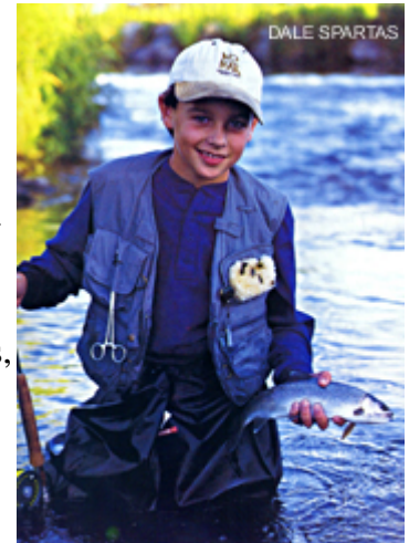
This boy caught a trout with a fly rod and fly.

Anyone can learn to catch fish with a fly rod. Learn the basics on the following pages. Then head outside and practice. Fly-fishing is like any sport: No one is great at it right away, and the more you practice, the better you get.