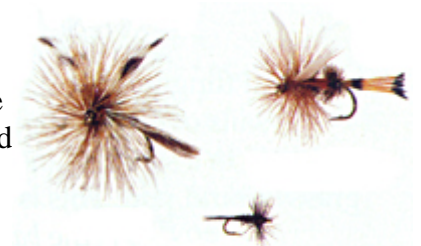
(clockwise from left) Adams, Royal Coachman, and Black Midge

Surface flies float. The neat thing about fishing with a fly on the water surface is that you can see when a fish comes up and bites it. Dry flies, terrestrials, and bugs are all surface flies.