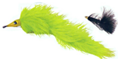
Barry's Pike Fly (left) and Bead-Head Woolly Bugger

Bugs include poppers, divers, and sliders. Twitch these flies forward little by little to disturb the water and attract fish. They imitate large insects, frogs, or mice.