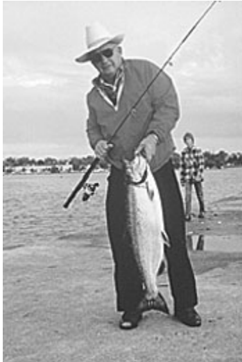
A whopper!

Some hot spots during these weeks in the last few years included Mason Lake in Adams County, Lake Koshkonong in Rock County and the Gile Flowage.