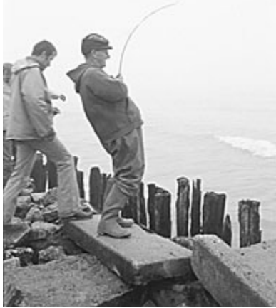
A bite on the pier.

In southern Lake Michigan, the coho and chinook runs in Racine County were good above the Highway 38 bridge. Fish the downstream area for brown trout and steelhead. Throughout the month, try the piers and tributary streams from Milwaukee harbor south to the state line. Fish the Milwaukee River at Estabrook Park, in the harbor area, at veterans Park and McKinley Park for brown trout.