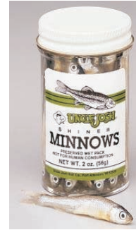
Chemically preserved minnows are an option for anglers who fish dead bait

Can I collect my own minnows without a permit? Yes, you can collect minnows for personal use as long as you use them only on the water you collected them from. You'll need to drain the water