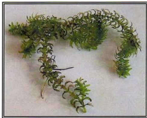
Hydrilla stems with leaf whorls