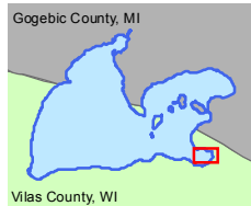
Extent of large map shown in red.

Sources: Roads & Hydro: WDNR Aquatic Plants: Onterra 2009 Bathymetry: WDNR - Digitized by Onterra Map date: May 28, 2009 File Name: LVD_T2009_EWM_Cond1.mxd