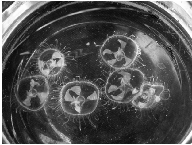
Several adult freshwater jellyfish ( Craspedacusta sowerbii ) in the medusa stage.

Much of the information for this chapter was compiled by Sandy Engel. Additional data is from: http://www.jellyfish.iup.edu/index.html